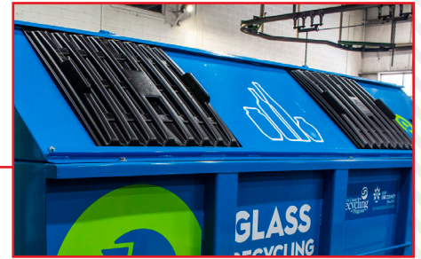
30" x 30" Sliding Lids (2 per Side)