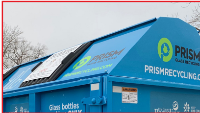
29" Gambrel Roof