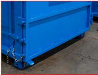
96" Outside Floor Width