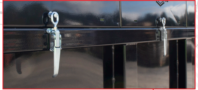
Cam-Latches for simple removal of some or all roof sections