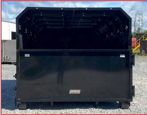
Single Swing or Barn Doors (Not available on 8' MDRB models)