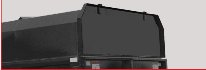
24" Rear Cover Plate (Optional)