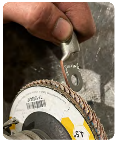
Figure 3: Griding flat plug