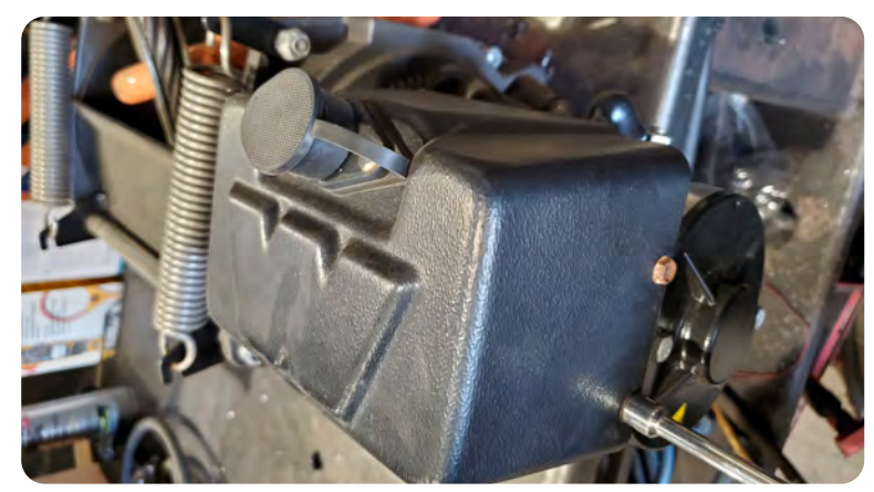
Figure 1: Unscrewing controller cover