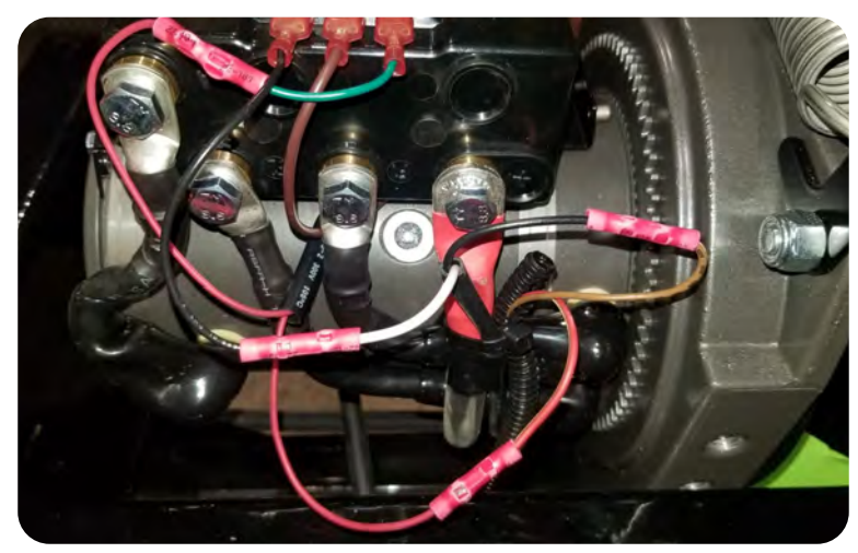
Figure 2: G1 wiring