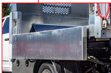
Drop Down Sides (optional)