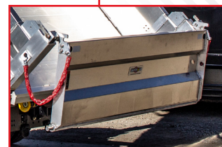
Double Acting Ramp/Dump Gate (Not recommended for heavy equipment)