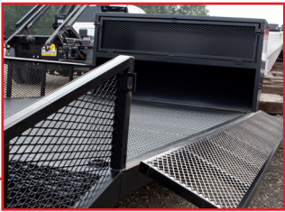
Passenger Fold Down Side