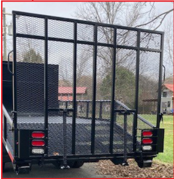
Spring Assisted Fold Down Ramp