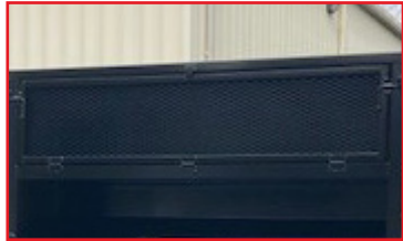
Lockable Top Compartment