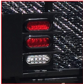
LED Tail Lights