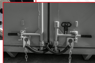
Dual Locking Mechanism